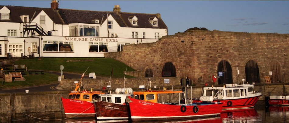
village of Kirkwhelpington.

The Way leaves the River Coquet at Rothbury and heads south, passing through some of the most, beautiful, interesting and ancient features of the trail. Entering the Northumberland National Park, you pass Lordenshaws, an important archaeological site. Here you will see an Iron Age hill fort and some mysterious Neolithic rock art. The path rises up over open moorland, with spectacular views of the sandstone formations on Simonside, to the highest point on the trail, Coquet Cairn. Here it enters Harwood Forest, where you walk on forest tracks, often getting lovely open vistas of the surrounding landscape. Leaving the forest behind, you cross wide open fields and farmland, to reach the