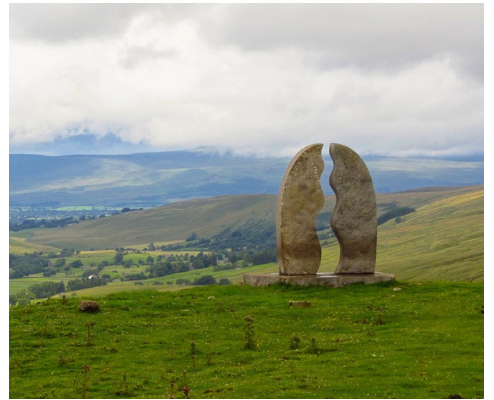
Hawes, one of the highest market towns in England.