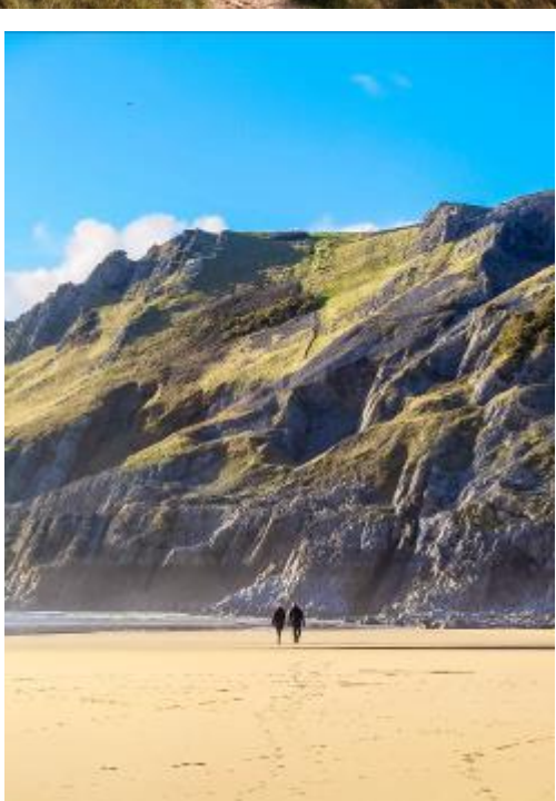
How to Book

Our holidays are designed to be flexible and can therefore be tailored to suit your requirements. If you're looking for something different, or extra, from the holidays described here, give us a ring and we'll do our best to please. You can start on any day you like and we can arrange extra nights at any of the overnight stops allowing for rest days, or giving you more time to explore the locality. You can book part of a walk if you don't have the time to complete the entire distance.