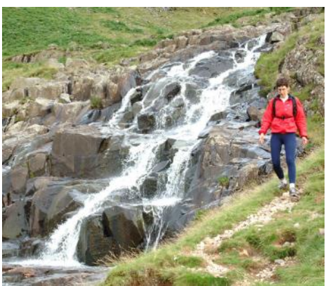
characterful accommodation close to the trail. Occasionally we may use a chain hotel.

The Cumbria Way includes a great variety of accommodation, including small country hotels, guest houses, bed and breakfasts, farm house accommodation, and Victorian town houses. In selecting the accommodation we look for helpful, friendly hosts with good quality,